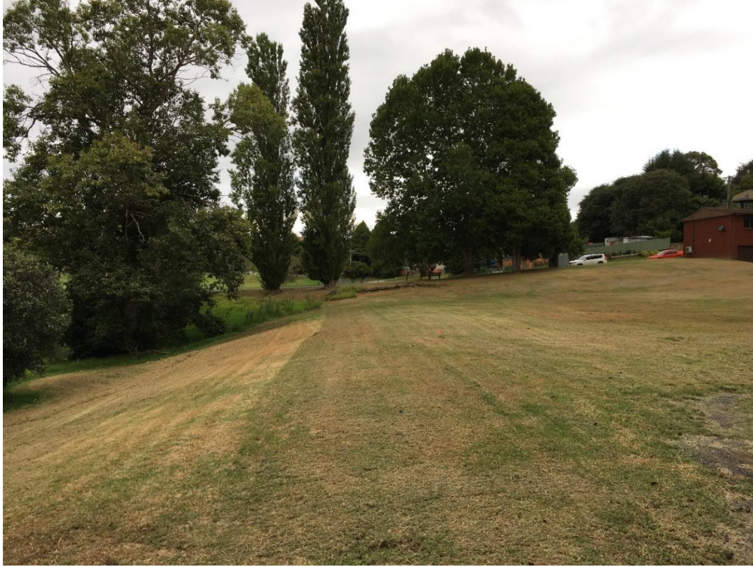
Photo 1. The study area, looking east towards Auckland Street.