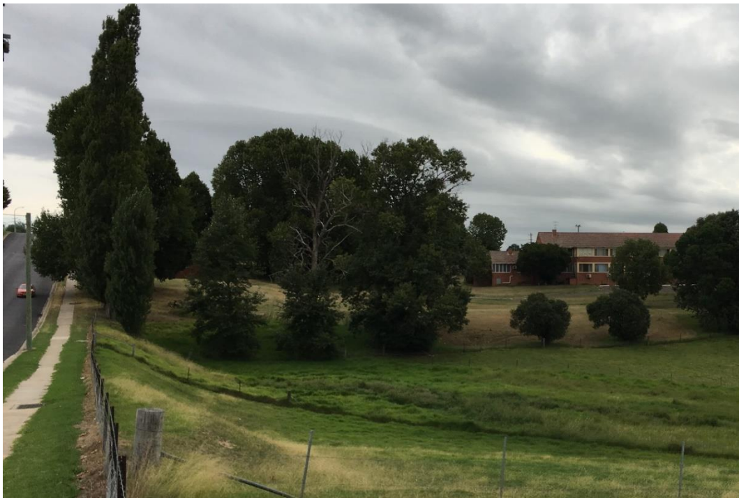
Photo 2. Looking south, Auckland Street to the left, across the drainage depression to the study area beyond the line of trees.